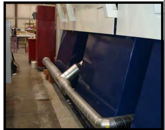
MM1200 Ducted to Machining Center

High Visibility: The opportunity to apply so many different Micro Air products on different applications helps Micro Air get some recognition from the big aviation manufacturers such as Spirit, Boeing, Hawker Beechcraft, Learjet, and Cessna that visit this facility on a daily basis.