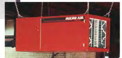
Ambient Air Cleaners